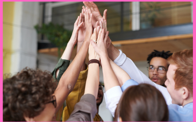
Can Work Collaboratively With Co-workers