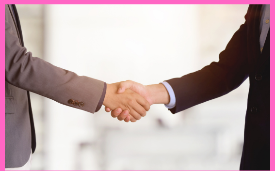
Honest and Trustworthy