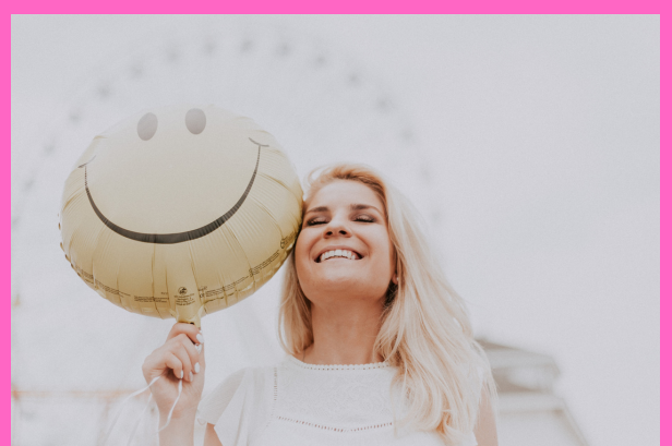
Upbeat and Positive Attitude