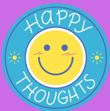
Positive and Inspiring