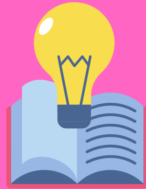
Willing to Learn New Things