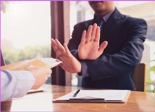
Honesty and Integrity